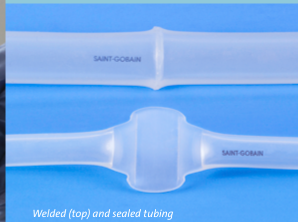
Welded (top) and sealed tubing