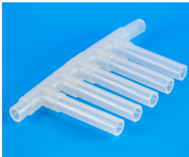
One-piece overmolded C-Flex manifold maintains inner bore diameters with superior reliability and product integrity.